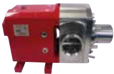
STP 125—Stainless Steel Food & Chemical Pump