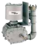
DuroFlow Transport Series