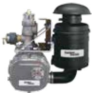
CycloBlower Transport Series